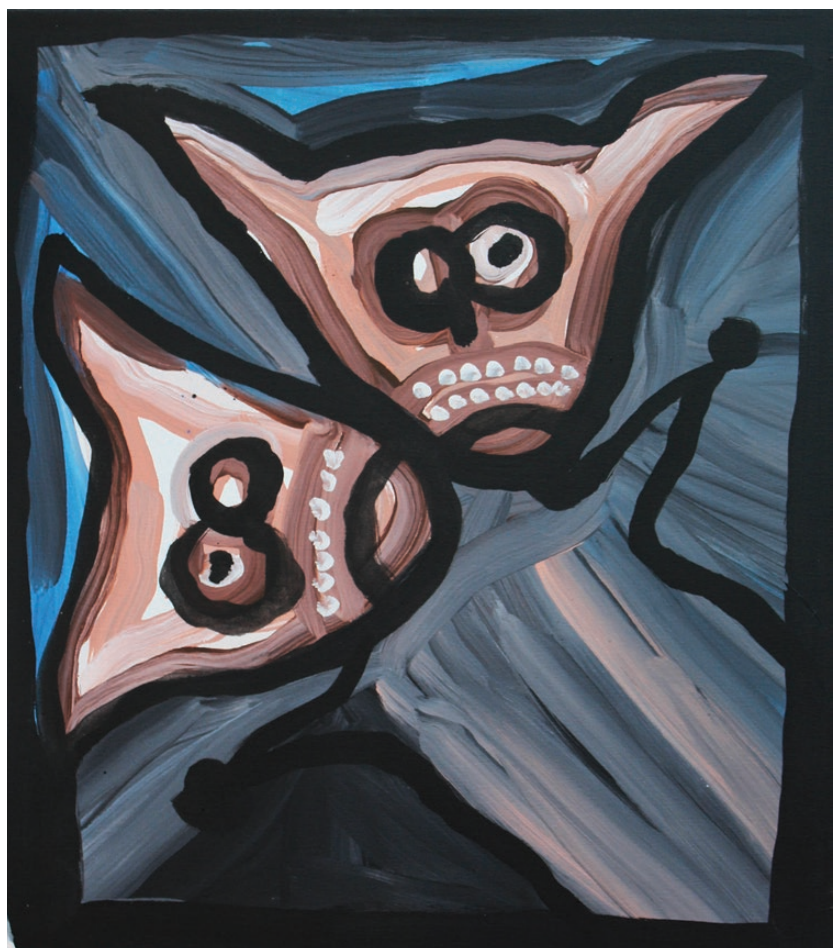
Argula Biddy Dale Acrylic on canvas 635mm x 730mm