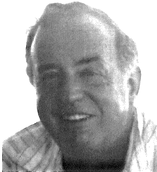
Lord Alexander of Weedon QC

"Eloquence is like the flame. It requires fuel to feed it, motion to excite it, and it brightens as it burns."