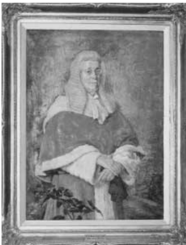
Sir Frederick Jordan.