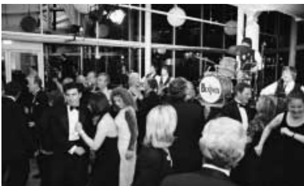
The Beatniks entertain the guests