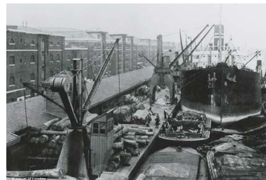
The West India Docks in 1900, St Bride's Wharf was nearby.

As to how the Moorcock came to be grounded, history has left us no photo. The Wikipedia entry is of the London docks around 1909. Fittingly, a Thames tug built in 1959 called the Moorcock collected a solid following among shipspotters 12 and model builders. 13 We do know, however, that this part of the river was a very different and very busy place.