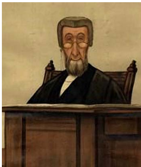
Sir Charles Parker Butt – Caricature by Ape published in Vanity Fair in 1887

The younger reader may be confused about court hierarchy. To recap, in England, they call the primary court the High Court, the