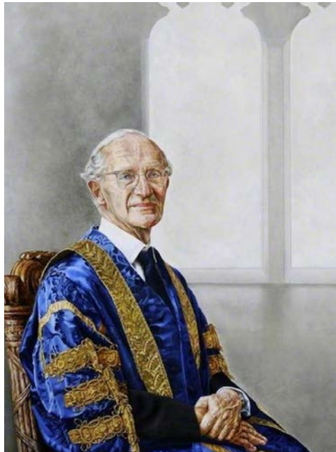
Lord Wilberforce (in oil, ho ho).