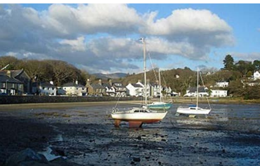
It's either Borth-y-Gest or The Moorcock reprised. http://www.snowdoniaguide.com/borth_y_gest.htm