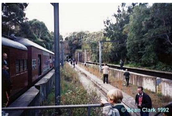
Rush hour at Woollahra Station.

intervene if Codelfa committed an actionable nuisance. No doubt the Commissioner and Codelfa shared a mistaken belief that Codelfa would be able to work three shifts a day lawfully, or at least without liability to restraint by injunction, because they mistakenly believed that s. 11 of the City and Suburban Electric Railways Act conferred an immunity upon Codelfa . That mistake could not give rise to an implied term. If, at the time when the parties were signing the contract, the officious bystander had asked what did they intend in the event of the issue of an injunction restraining work during the night shift, they would have replied: 'We have thought of that. It cannot happen.' They cannot be presumed to have agreed upon a term inconsistent with their common belief.